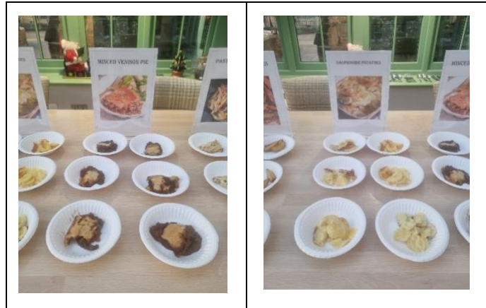
Minced Venison Pie